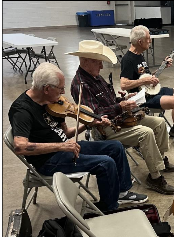
A well-attended District 5 jam