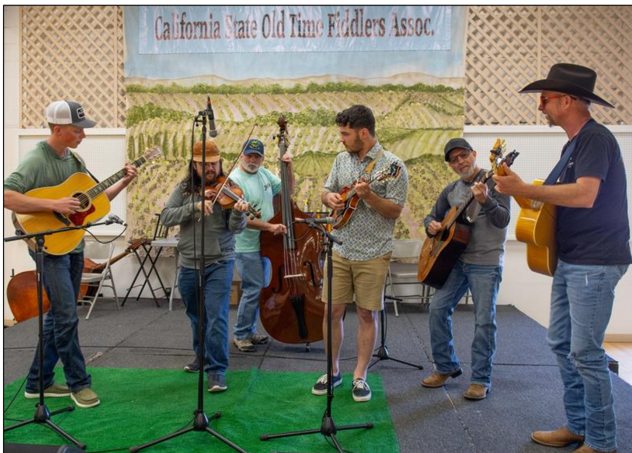
Fiddlers competing at 2024 California State Old Time Fiddle and Picking Championships.