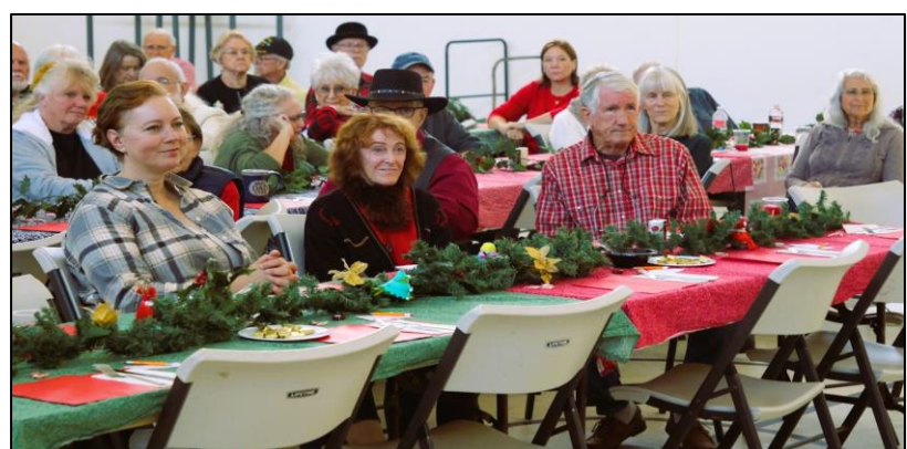
District 8 holiday dinner attracted 60 members.