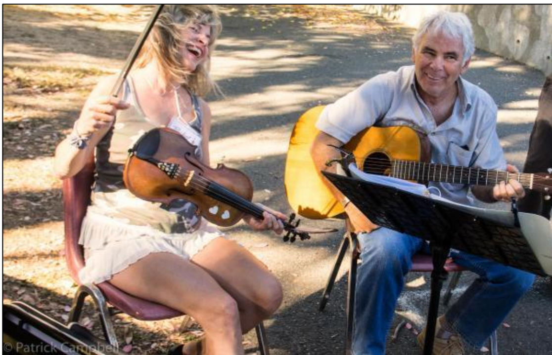
Jamming at Walker Creek Music Camp