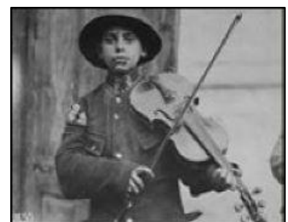
Historic image from District 10 website