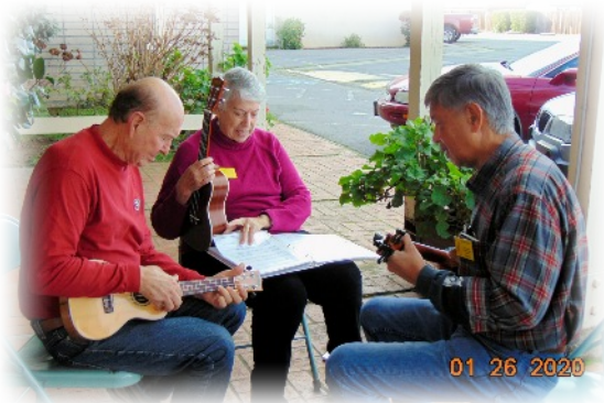
Ukulele circle trading tunes at the January Jam.