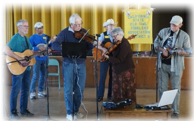
A few of our members presenting tunes at the November Jam.